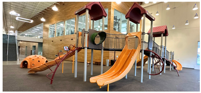
WE OFFER A PLETHORA OF ACTIVITIES TO KEEP YOUR FAMILY ENTERTAINED. SEE IT FOR YOURSELF AND COME HAVE FUN!